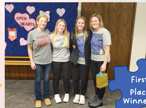
First Place Winners!